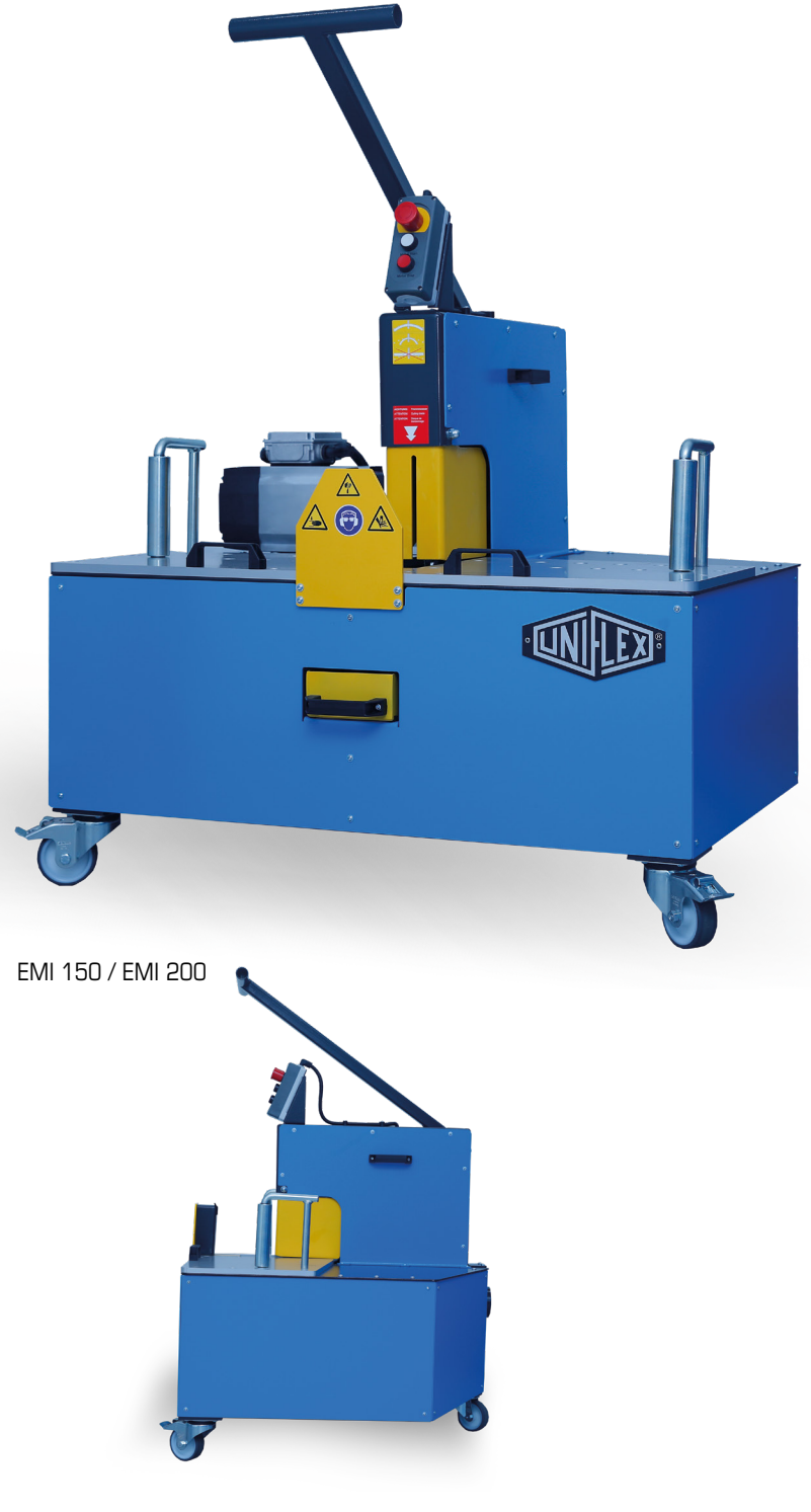
EMI 150 / EMI 200

Each machine comes with a 2-year warranty for the best return on investment.