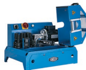
USM 10 S