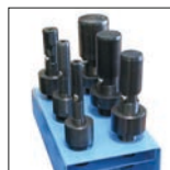
USM 10 S - 313.1 Set with 6 mandrels. Internal skiving mandrel.