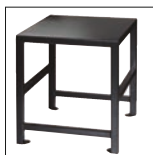
TU - work bench