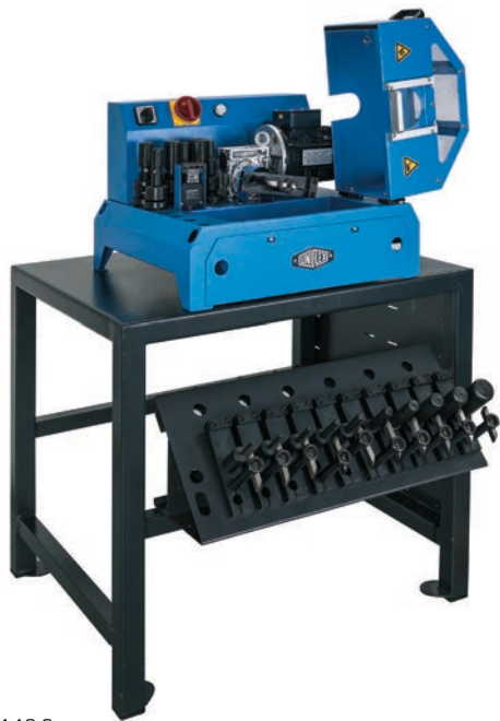
USM 10 S With TU Table and tooling storage.

The new skiving machine, with the fastest change-over time due to preset tools and simple locking pins. The USM 10 S skives internally from 5/8" up to 2" and externally from 3/16" - 2" dies, making the system the perfect solution.