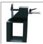
SSG Slitting tool – to keep the skiving chips short